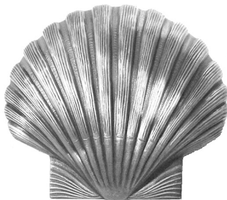
Plate 5 Shell of the Order Hinge down Bronze, Knight & Past Master Silver, holder of Provincial Rank Gold, holder of Grand Rank