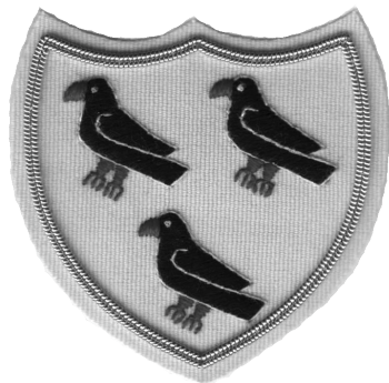
Plate 6 Pilgrimage Chough