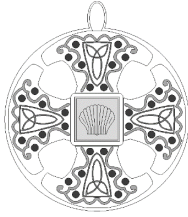
Plate 1 Bronze Past Master Silver Provincial Officer Gold Grand Officer